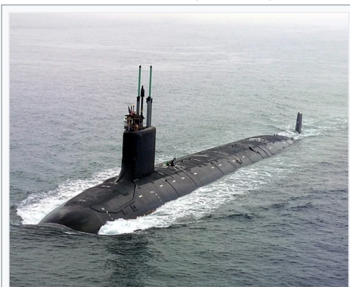
The lead boat of the Virginia class, USS Virginia (SSN-774)

CALL TO ACTION: The Arizona Sons of The American Legion are spearheading an effort to collect the brass grommets from as many retired national flags as possible. WHY? In 2025 (estimated) , the 4th naval vessel to carry the name USS ARIZONA (SSN-803) will be launched . This will be the first time a vessel has held the name since 1941. We are jointly working to collect brass grommets to be combined with AZ-mined copper to create three brass bells to be presented to the Navy, with one to be selected as the new vessel's bell. ACTION: Please have your members and Scouts collect/save all brass grommets from retired or "to be retired" USA Colors and have them ready for a pick-up 19-24 February. Provide the name of the donor or organization (and their location) as they will become part of the bells' official history. The new USS ARIZONA will be a Virginia Class submarine (as pictured left).